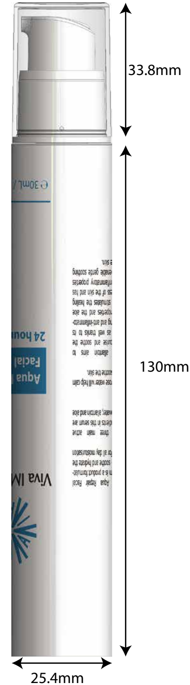
D25 LOTION PUMP

Dispense by pressing down the button. Dosage: 0.2ml